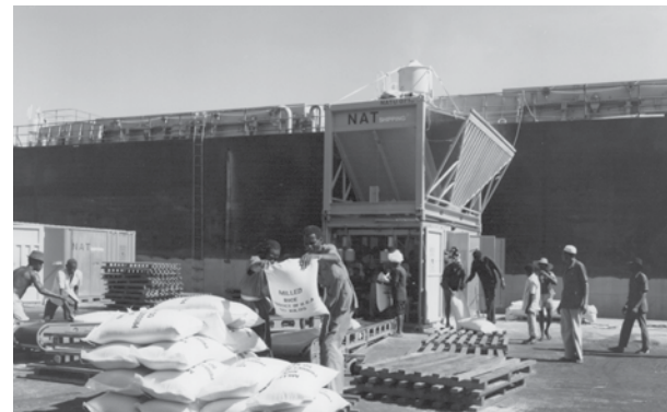
East Africa: An early generation 'Mopack' Bagging machine handling aid cargo in one of the first operations of its kind.

Over its 44 year history of delivering high class professional bulk handling services and solutions to clients Nectar has developed important strategic relationships and specialist knowledge of port infrastructure across the world, enabling the Group to gain early insights into projects and capitalise on a diverse range of opportunities as and when they arise.